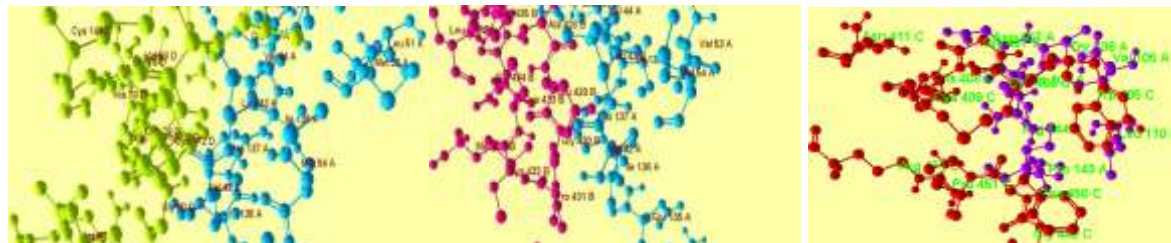
(a) ZP3+IZUMO 1 (b) ZP3+ ADAM 2 (c) ZP3+ERp57