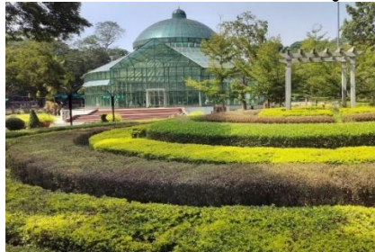
Fig. 30 : https://www.thehindu.com/news/national/karnataka/dasara-air-show-in-mysuru-on-october-23/article67403606.ece

Every year, Mysore celebrates a magnificent celebration known as the Dasara Flower Show. Specifically, this large-scale event is scheduled for September–October at Nishad Bagh. The enormous variety of orchids and roses is the main draw of this floral exhibition.