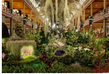
Fig. 4 : https://melbflowershow.com.au/2022-show-winners-revealed/

When: Every year in April, the Melbourne International Flower & Garden Show takes place over five days.