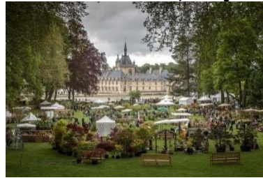
Fig. 9 : https://www.hellotravel.com/events/orticolario

Taking place each autumn, in the gardens of the magnificent 19th-century Villa Erba, Cernobbio, an outstanding setting on the western coast of Lake Como in northern Italy, this elegant Italian gardening exhibition attracts over 300 exhibitors. The festival brings together top designers, nurseries, and garden product companies with an eye toward the best in gardening, art, and design. There are eye-catching installations and displays along with talks, creative workshops, entertainment, and seasonal food and drink available. A shuttle boat from Como crosses the lake to the villa's wharf, where a number of elegantly attired visitors disembark to attend the show.