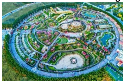
Fig. 28 : https://www.adotrip.com/event-detail/international-flower-festival The spectacular Gangtok International Flower Festival, held in Sikkim's capital.