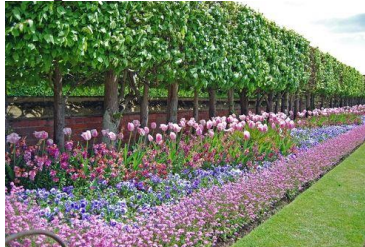
Fig: 3 : https://www.cherryhillgardencentre.co.uk/news/50/rhs-hampton-court-palace-flower-show

When: Every year, from Tuesday through Sunday, the Hampton Court Palace Flower Show concludes on the second Sunday of July.