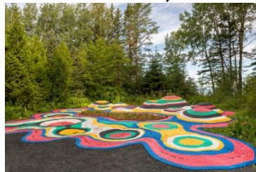
Fig. 10 : https://worldlandscapearchitect.com/2021-international-garden-festival-at-les-jardins-de-metis-calls-for-proposals/?v=c86ee0d9d7ed

Reford Gardens, also known as Jardins de Métis, are situated on the St. Lawrence River's south shore, northeast of Quebec City. They were founded by Elsie Reford, who created an incredible network of gardens between 1926 and 1958 by transforming a former fishing camp and a part of a forest. This stunning locale serves as inspiration for the annual International Garden Festival, which since 2000 has featured over 250 gardens and displays by designers from 15 countries. Acknowledged for its ingenuity, support, and innovative concepts, it draws individuals from diverse domains.