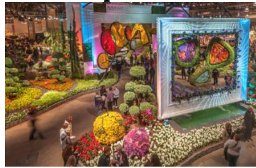
Fig: 1 : https://cthort.org/event/philadelphia-flower-show-march-8-10/

When: Every year in March, Philadelphia hosts a 10-day floral exhibition. Where: The Pennsylvania Convention Center, 1101 Arch St., Philadelphia, PA 19107 is the venue where the concert is being held.