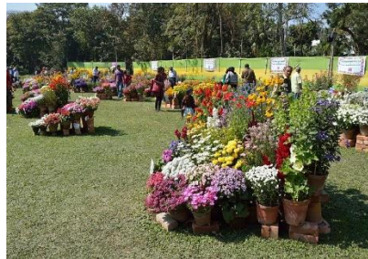
Fig. 20 : https://plants.expertscolumn.com/flower-show-by-agri-horticulture-society-kolkata

The Kolkatta (formerly Calcutta) Horticultural Society hosts a flower exhibition each winter showcasing a variety of flower varieties. Actually, one can learn about gardening and growing