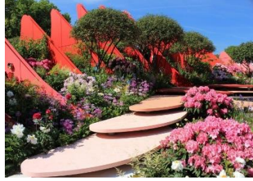
Fig: 2 : https://www.tripadvisor.in/Attraction_Review-g186338-d10020593-Reviews-RHS_Chelsea_Flower_Show-London_England.html

When: Every year, the Chelsea Flower Show takes place over five days in May. Where: The performance takes place on the Chelsea grounds of the Royal Hospital in London. About: Since 1912, the Chelsea Flower Show has been organized by the Royal Horticultural Society. More than 150,000 people visit it every year, making it one of the biggest in the world. Over the years, the fairgrounds have grown to accommodate larger and larger visitors. The show's theme is the renowned British gardens, and contestants fight to win ribbons for their masterpieces in gold, silver-gilt, bronze, and gold.