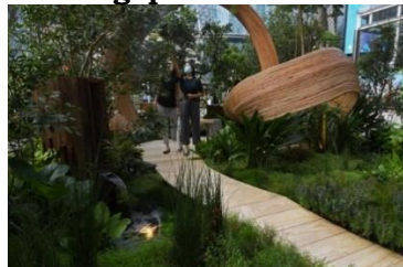
Fig. 5 : https://www.globaltimes.cn/page/202207/1271773.shtml

When: Every two years, the Singapore Garden Festival takes place.