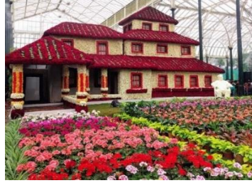
Fig. 18 : https://utsav.gov.in/view-event/lalbagh-flower-show-2

The Great Spring display, an annual flower display hosted by the Royal Horticultural Society of England in the later part of the nineteenth century, served as the model for the Lalbagh Flower Show.