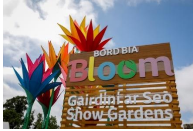
Fig. 6 : https://www.bordbiabloom.com/

When: Every year, the takes place in June over five days.