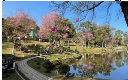
Fig. 31 : https://northeastlivetv.com/around-ne/meghalaya/meghalaya-govt-this-year-cherry-blossom-festival-will-not-be-held-in-shillong/

Northeastern India, where every day appears to be a flowery celebration during the summer and spring. In November, Shillong, Meghalaya, hosts the Cherry Blossom Festival.