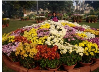
Fig. 25 : https://alumni.bhu.ac.in/f/malviya-smriti-flower-show-19000#:~:text=The%20flower%20show%20is%20visited,th%20%E2%80%93%2027th%20December%202022.

On December 25, we celebrate the Malviya Smriti Pushp Pradarshani, which honors the illustrious Bharat Ratna Pt. Madan Mohan Malaviya Jee's birth anniversary. It began in 1971 and has since been held at Banaras Hindu University, Varanasi's Malviya Bhawan by the Horticulturist Unit of BHU.