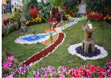
Fig. 21

Every year, the Empress Botanical Garden in Pune hosts a flower display with a focus on roses. The Agri Horticultural Society of Western India is currently in charge of organizing the exhibition, which was founded by the English monarch.