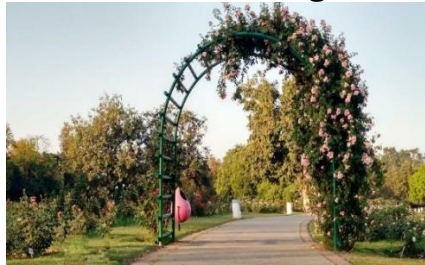
Fig. 27 : https://chandigarhtourism.in/images/places-to-vist/headers/zakir-hussain-rose-garden-chandigarh-tourism-entry-fee-timings-holidays-reviews-header.jpg

Every year, a three-day Rose Festival is held in Chandigarh's Zakir Hussain Rose Garden in February. The flowers and cleanliness of Chandigarh make it a lovely city in and of itself. Thus, if you happen to be in this city in February, you can visit the magnificent rose festival and have a wonderful vacation.