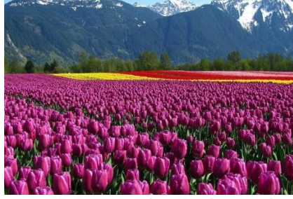
Fig. 26 : https://www.viator.com/en-IN/tours/Srinagar/Kashmir-Tulip-Festival/d23017-115251P1

Nothing compares to the Tulip Festival in Srinagar, Jammu & Kashmir, to kick off this list of amazing floral festivals and events in India. The greatest months to visit Srinagar are March and April, and this fantastic festival gives even more motivation to visit Kashmir.