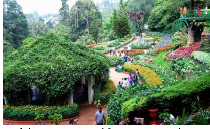
Fig. 24 : https://www.travel2ooty.com/ooty-flower-show.aspx

Every year in May, the Queen of Hills, Ooty, celebrates the renowned Ooty Summer Festival. Many domestic and foreign tourists come to this event to participate in the many activities held there. In May, the Nilgiris District Summer Festival is jointly organized by the Tamil Nadu Department of Tourism and the Department of Horticulture.