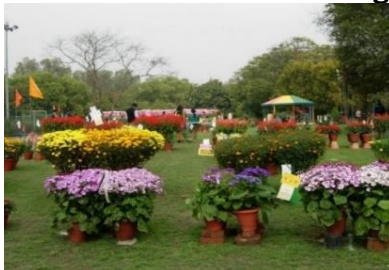
Fig. 23 : https://dynamic-media-cdn.tripadvisor.com/media/photo-o/05/78/04/b3/leisure-valley-park.jpg?w=1200&h=1200&s=1

India's capital city, Delhi, is not far from Gurgaon. Every summer and winter, the Haryana state department of horticulture hosts a flower exhibition in Gurgaon. Roses are the focal point of the flower presentation. In addition to roses, bonsais and many Dahlia varieties are on display during the flower show.