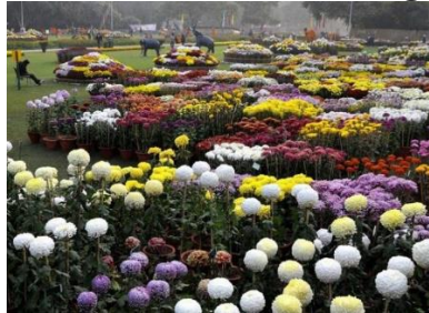
Fig. 19 : https://chandigarhx.com/chrysanthemum-show-2017-dec-8-chandigarh/

The Chrysanthemum flower is a well-known feature of Chandigarh, Punjab. Other names for these flowers include mums or chrysanthus. They have a plethora of various hues mixed in with a dark crimson color.