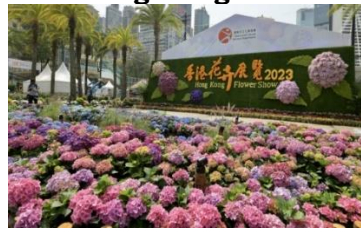
Fig. 16

The Oncidium orchid has been chosen as this year's subject for the floral display in Victoria Park, unlike most flower displays that center on a concept or location. Approximately 500,000 people have attended previous events, which have featured photo competitions, musical and cultural performances, and quirky animal exhibits.