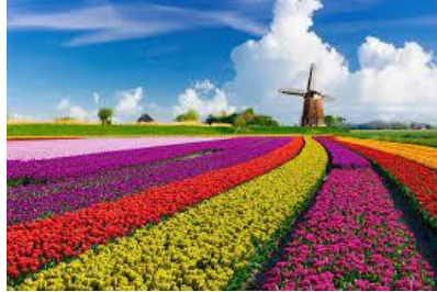
Fig. 12 : https://www.getours.com/expert-travel-advice/history-traditions-celebrations/amsterdam-tulip-festival-keukenhof-gardens

The Tulip Festival Amsterdam is a series of flower-related activities that happen in and around the Dutch capital throughout the spring. These events include the Dutch Flower Parade, which features highly designed floral floats, and tours of the area's renowned tulip fields. The centerpiece of the festival is Keukenhof Gardens, which is celebrating its 75th anniversary this year with 79 acres of exquisite floral arrangements. Approximately seven million spring-flowering bulbs were planted in a range of vibrant arrangements last fall, with the intention of blooming all season long. Ten kilometers of hiking trails throughout the park allow visitors to view the exhibits.