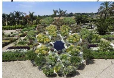
Fig. 8 : https://www.mediterraneaonline.eu/radicepura-garden-festival-lancia-la-call-for-ideas-2021-giardini-per-il-futuro/