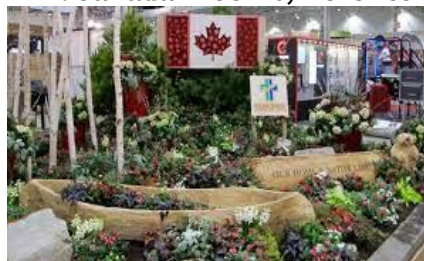
Fig. 14 : https://www.torontogardens.com/2017/03/a-viral-tour-of-canada-blooms-2017.html/

Every year, Canada Blooms is a premier event that promotes, teaches, uplifts, and celebrates all facets of horticulture in an effort to help people discover the pleasures and advantages of being in nature via interactions with gardens and flowers.