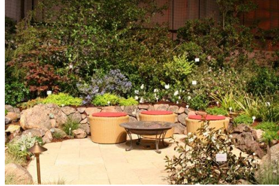
Fig. 15 : https://www.landscapingnetwork.com/training-events/san-francisco-flower-and-garden-show.html

The subject of this west coast show, which is in its 30th year, is "Going Wild." Expect fifteen intricate garden exhibits that resemble "Vintage California," which took home the Best of Show award the previous year (see photo). After viewing the displays, there are lectures to attend, and kids may participate in hands-on activities in the Pollinator Pavilion, where they can create a bee hotel and use a microscope to observe butterflies. This year's addition is the Urban Homestead, where you can discover beekeeping and cheesemaking while unleashing your inner pioneer.