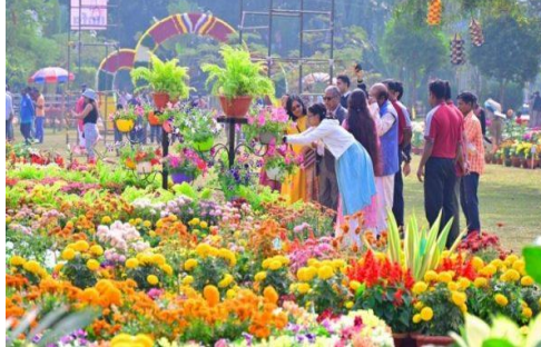
Fig. 32 : https://odishabytes.com/annual-flower-show-opens-at-ekamra-kanan-in-bhubaneswar/

Annual Flower shows ekamra kanan botanical garden. For two days, the public is welcome to attend the flower display, which is being co-hosted by the Plant Lovers' Association and the Regional Plant Resources Centre (RPRC). Inside the Ekamra Kanan, Biswal explored the flower garden, exhibition stalls, Plant Bazaar, and selfie station.