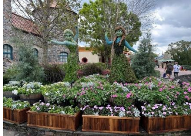
Fig. 13 : https://wdwnt.com/2023/03/photos-topiaries-2023-epcot-international-flower-garden-festival/

The flower display at Epcot at Walt Disney World appeals to people of all ages and interest levels, in contrast to other flower shows that are targeted toward die-hard gardeners. There are tons of Disney-themed topiaries everywhere, including the major characters from Frozen (above), in addition to gardens, talks, and displays.