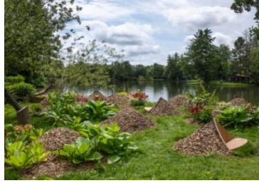
Fig. 11 : https://www.artetjardins-hdf.com/en/directory-project/festival-international-jardins-hortillonnages-amiens/

Spread across the Hortillonnages, a network of waterways and planted islets encompassing 740 acres in the center of Amiens, visitors to this unique yearly festival are greeted by a labyrinth of floating gardens. The name of the place comes from the Latin hortus, which means garden, and was molded by generations of hortillons, market gardeners who worked with the marshy terrain of the former River Somme bed. Visitors can explore on foot and by boat as part of the festival, which supports the creation of art, architecture, and nature. from the summer to the fall.